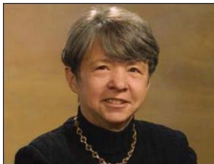
Mary Jo White Chair